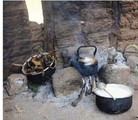
We work with local businesses to replace harmful fuels