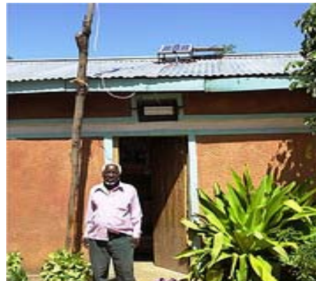
We advise on the best technology available (such as solar lights)