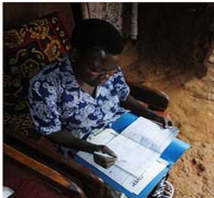
We help people acquire the right set of business skills