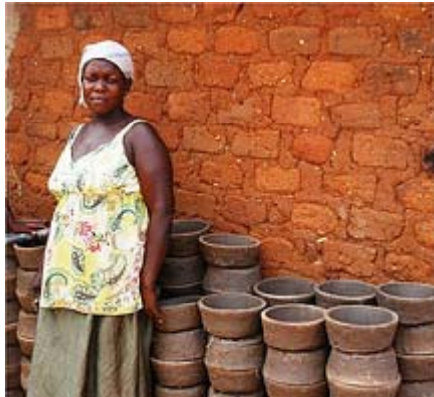
We provide training to entrepreneurs