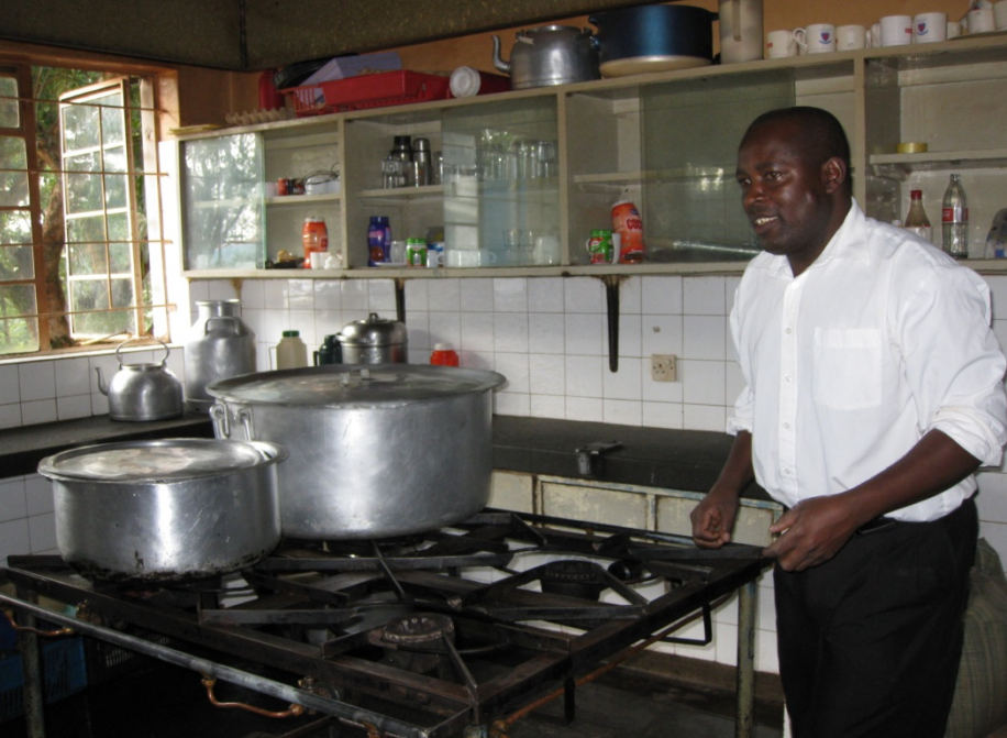
Cooking using biogas in a school kitchen